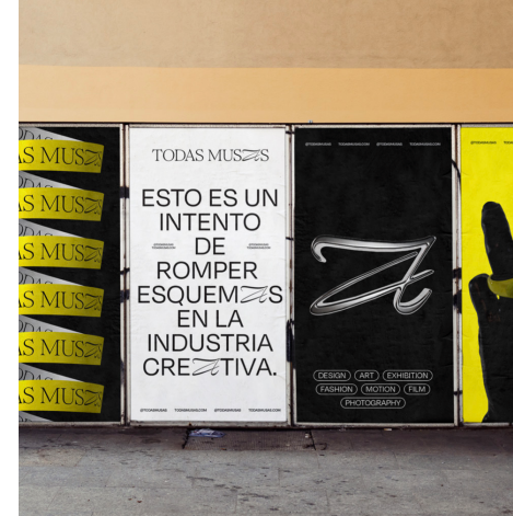
From left to right: "How to become your projects (and survive)", "Unwoven memories" and "Todas Musas".

The Design School exhibits three projects that propose new visions of the creative industry, mixing art direction, graphic design, web design, fashion, branding, motion graphics and 3D on "The Next Us" platform for emerging talent.